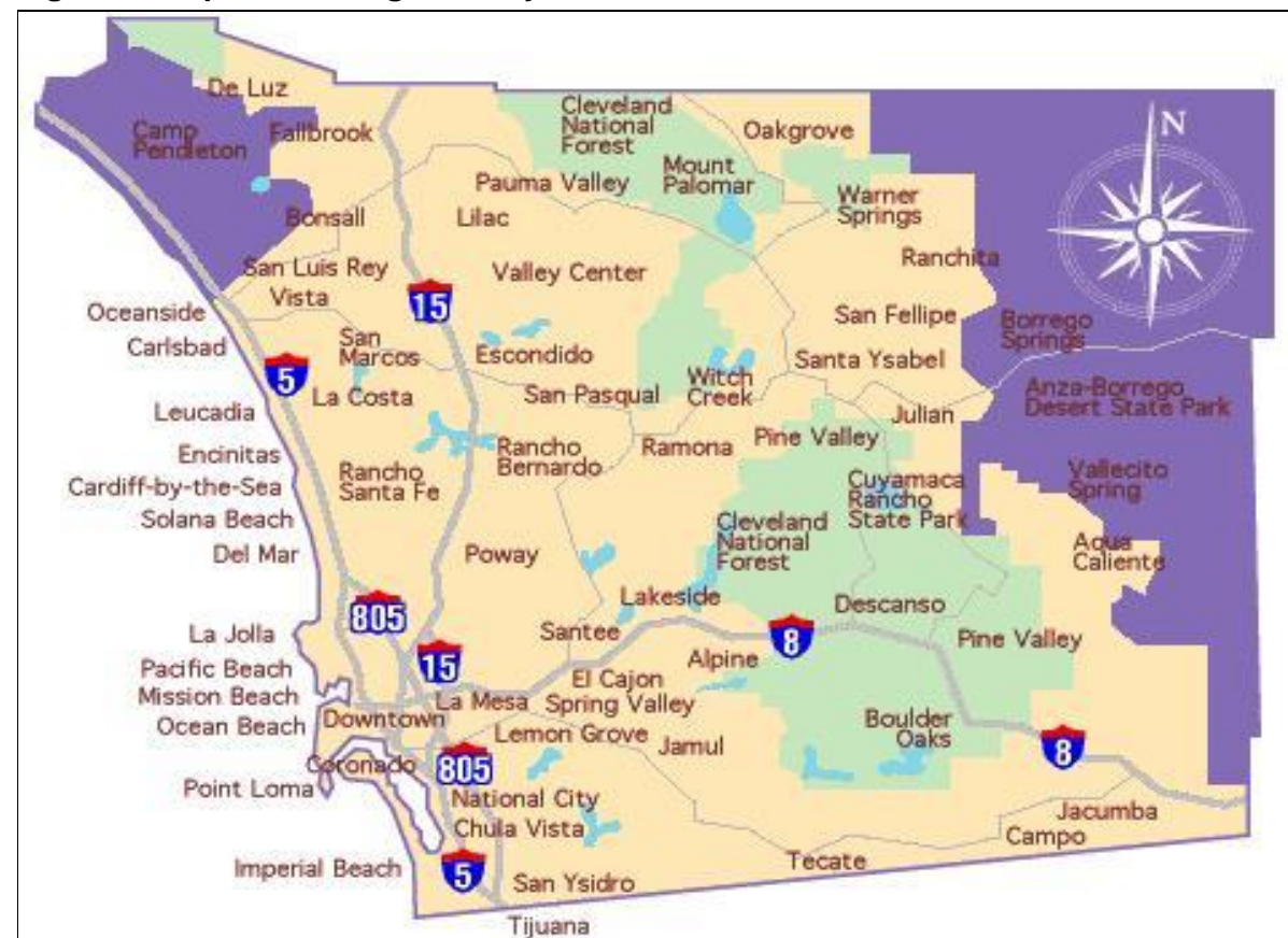
Figure 2: Map of San Diego County California