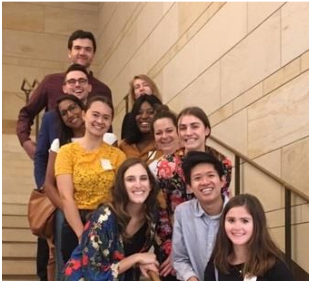
Our summer interns enjoyed a day on Capitol Hill, July 2019

Finally, we want to thank our dedicated 2019 interns, who provided amazing assistance to the Commission as we carried out our mission to advance respect for civil rights.