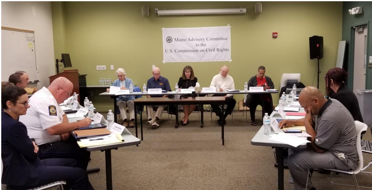
Maine SAC Briefing – Hate crimes, July 2019