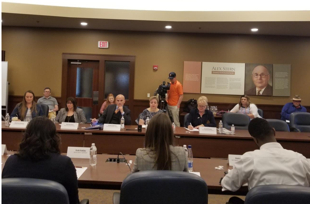
North Dakota SAC Briefing – Hate crimes, June 2019