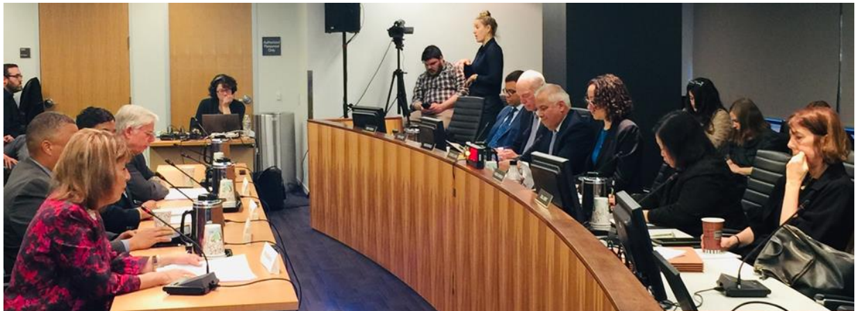
The Commission’s briefing on sexual harassment in federal government workplaces, May 2019

On May 9, the Commission held a public briefing , Federal Me Too: Examining Sexual Harassment in Government Workplaces , to examine the Equal Employment Opportunity Commission’s enforcement efforts to combat workplace sexual harassment across the federal government, including the frequency of such claims and findings of harassment, the resources dedicated to preventing and redressing harassment, and the impact and efficacy of these enforcement efforts. The briefing looked at agency-level practices to address sexual harassment at the Department of State and NASA. Commissioners heard from current and former officials, academic and legal experts, advocates, and individuals who have experienced harassment. We invite you to watch the briefing’s morning , afternoon , and public comment sessions; read panelists’ written testimony ; and view the agenda and transcript .