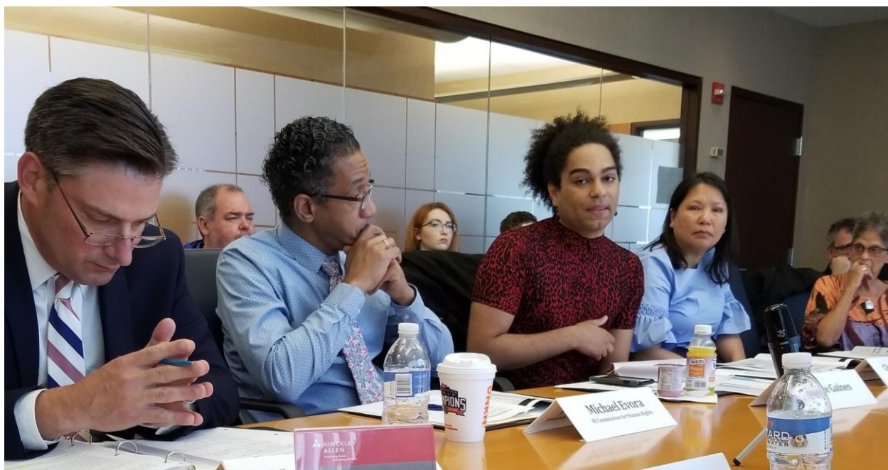
Rhode Island SAC Briefing – Hate crimes, June 2019