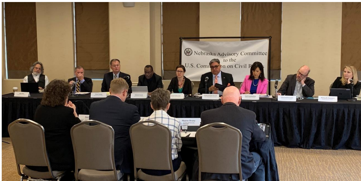
Nebraska SAC briefing – Prisons and mental health services, June 2019