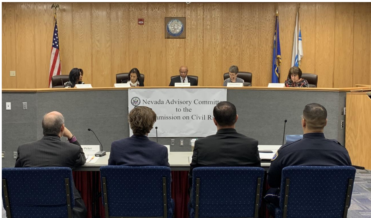
Nevada SAC Briefing - Policing practices, May 2019