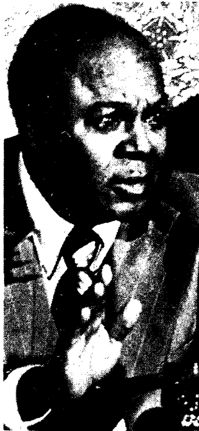
James Farmer Civil Rights Leader

Farmer, executive director of the Coalition of American Public Employees, a political arm of public employee unions, said the time has passed for a recognizable leader in the mold of the late Martin Luther King Jr. to emerge in the drive for equal opportunity. Much as whites are splintered into different groups, he said, minorities also