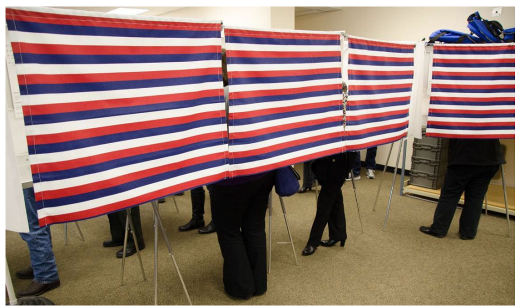
Voting in the City