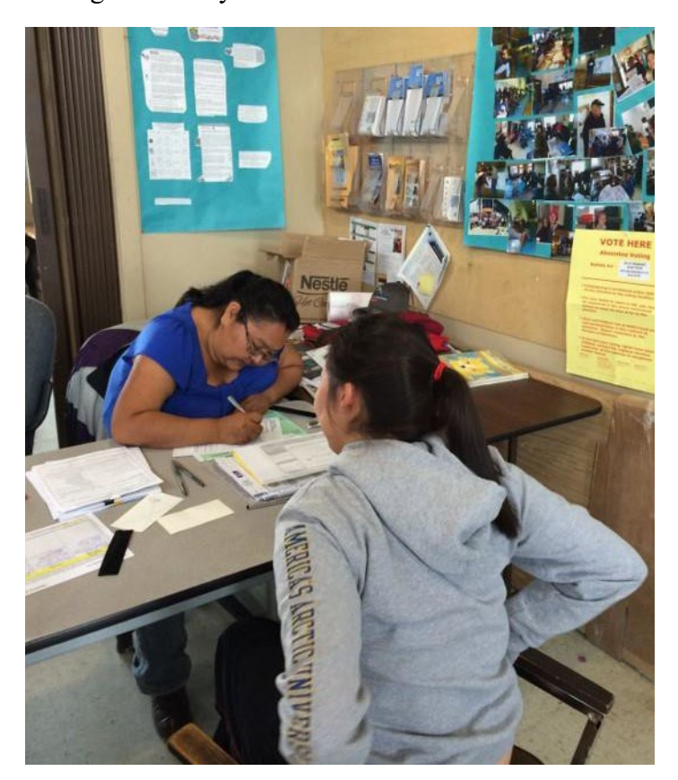
Voting in rural Alaska