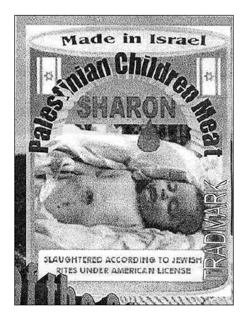
A flyer created by Muslim student groups and funded by the Associated Students of San Francisco State University dredges up the medieval anti-Semitic blood libel of Jews slaughtering children—this time Palestinian children—for ritual purposes.